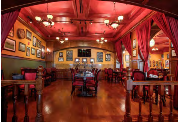
IMPERIAL PINT ROOM