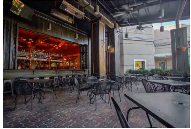
ROYAL COURT PATIO