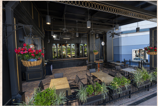
ROYAL COURT PATIO