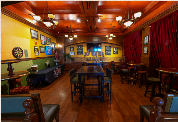
IMPERIAL PINT ROOM